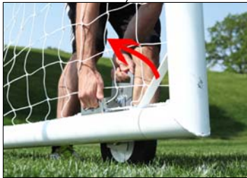
No. 295000 NEVER FLAT FLIP WHEELS 4 WHEELS INCLUDED PER GOAL

GOAL CAN NEST UNDER 8' OFFSET FOOTBALL GOAL POST